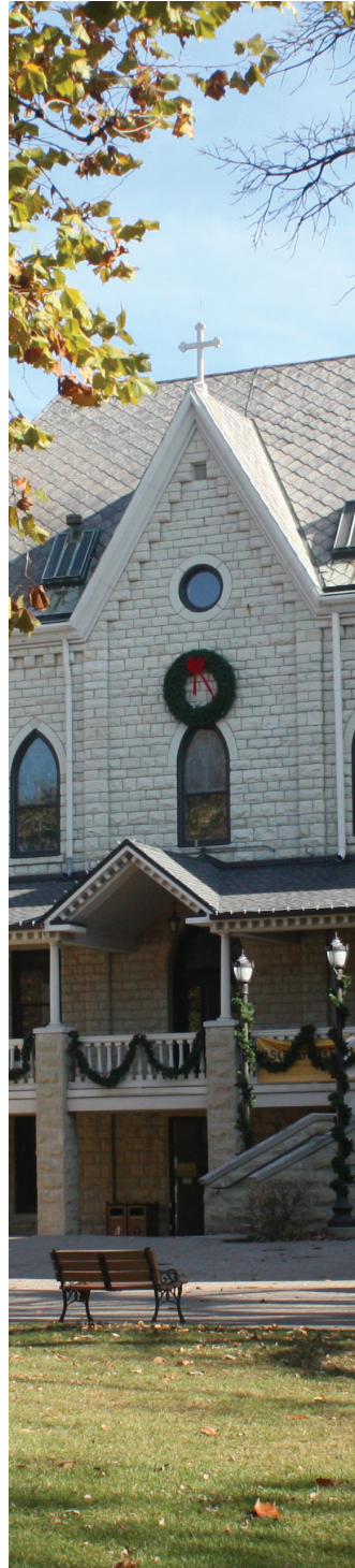
MAIN CAMPUS JOLIET, IL