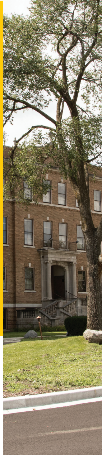
ST. CLARE CAMPUS