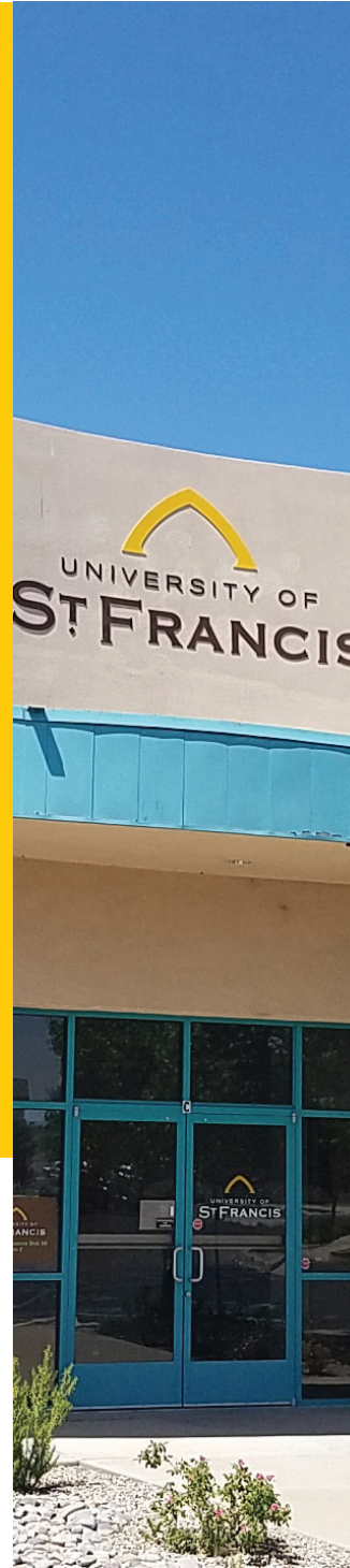
ALBUQUERQUE CAMPUS ALBUQUERQUE, AZ